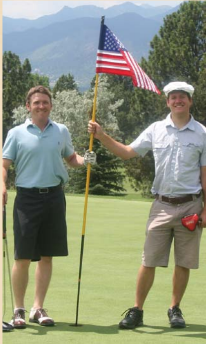
Patriotic Players on July 4th.