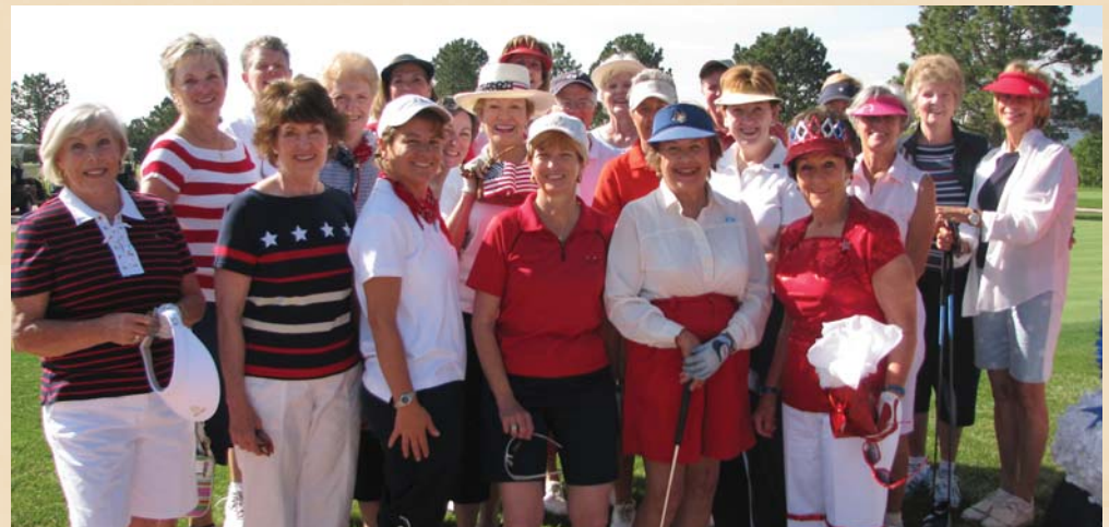
KCLGA - Fourth of July